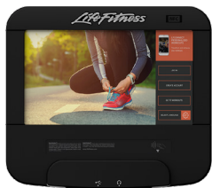
DISCOVER SE3 HD CONSOLE

The Elevation Series includes these console choices: