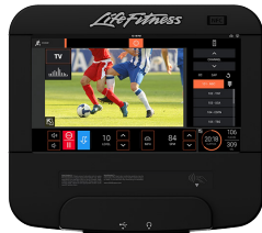
DISCOVER ST CONSOLE