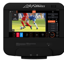
DISCOVER ST CONSOLE