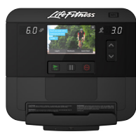
INTEGRITY X CONSOLE