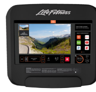
DISCOVER SE3 CONSOLE