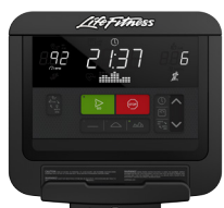
INTEGRITY C CONSOLE

Console choices include simple, get-on-and-go functionality to more engaging options. Each offers wireless connectivity and insights through LFconnect.com.