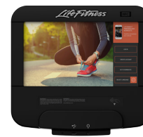
DISCOVER SE3 HD CONSOLE